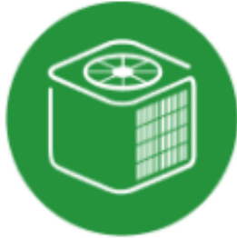
Heating, Ventilation & Air Conditioning