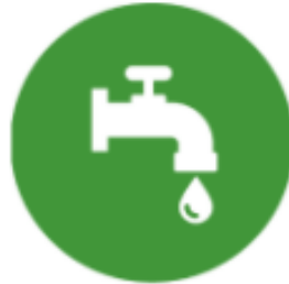
Water Heating, Faucet & Shower Aerators